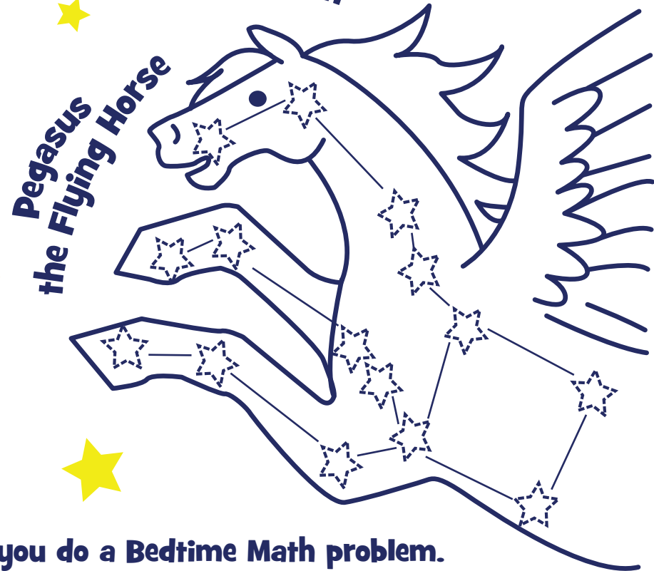
Pegasus the Flying Horse

Put a star sticker on a constellation each day you do a Bedtime Math problem. Find your fun, daily math problem on our website, on our free app, or from one of our zany books!